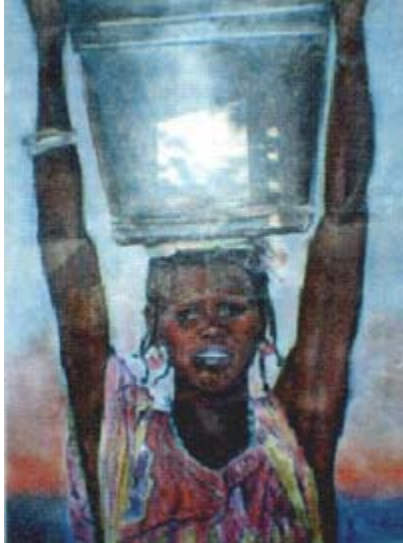
Painting by Oscar Lopez Rivera

Water is the earth's most precious resource. Access to safe and affordable water is a human right. Local, democratic control of water is essential for food security and peace. Accelerating privatization threatens public control over access to water while scarcity looms from overuse and pollution worldwide.