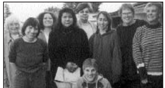
In Pajaro Valley, CA, WILPF members, a few of whom are shown here, have been at work for several years to create an effective bilingual branch.

Since the group is committed to being a bilingual branch, they are moving forward despite the struggles they have had. Right now, the branch is working on two projects: They are co-sponsoring a Racial Justice Initiative with the YWCA. This is a two-year initiative, working in coalition with other local organizations, to address racism. The other project is a bimonthly video program, with polit-