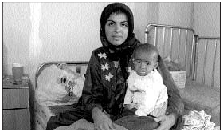
Iraqi mother comforts her sick child in a Baghdad hospital.