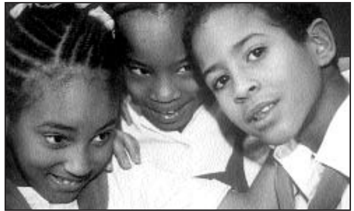
Above: Students at the School for Disabled Children in Havana.