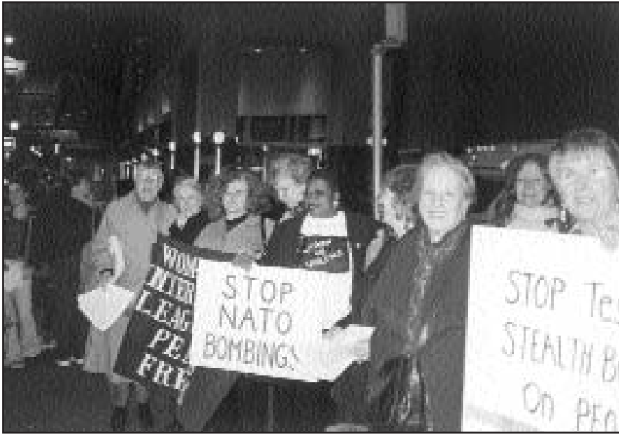
WILPF board members and staff take a break from the national board meeting in Philadelphia during late March to protest the bombing of Kosovo. Many people stopped to get leaflets and the event was written up in The Philadelphia Inquirer on March 27, 1999.