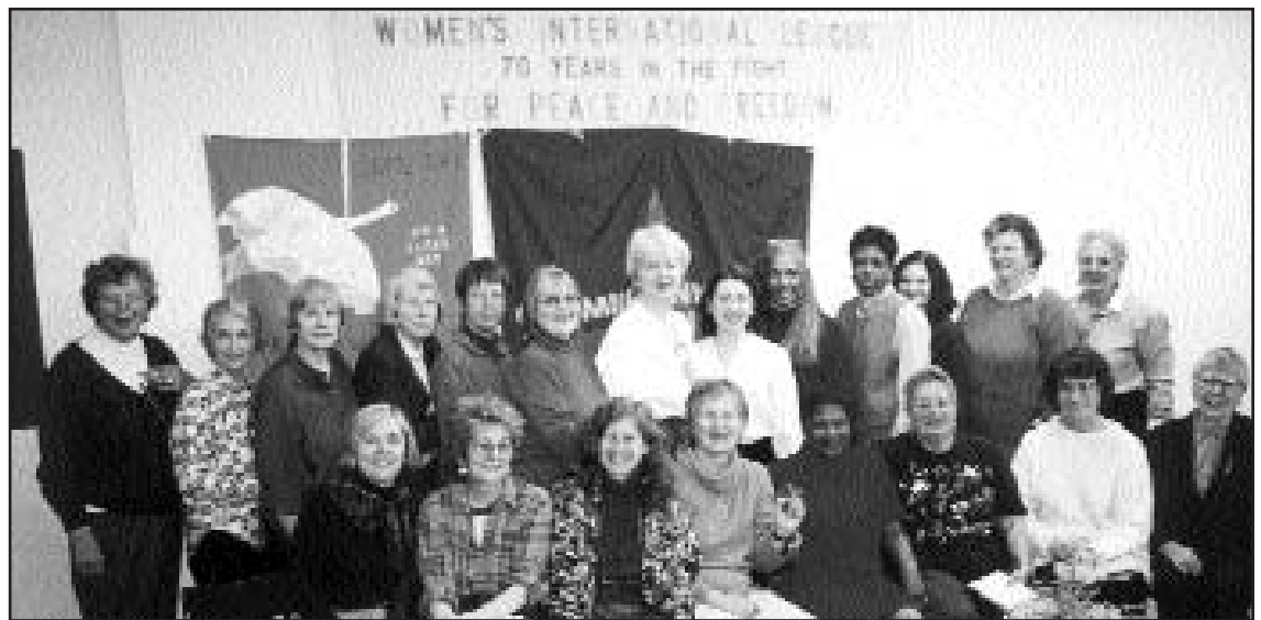
Members of the Change Mavens Committee joined WILPF board and staff for a national board meeting at the Philadelphia office in late March.

mantling homophobia, racial justice, U.S. and Cuban women’s solidarity, and the Women’s Peace and Justice Treaty of the Americas. All proposals will be available at Congress, regardless of the national program focus; WILPF members and branches will work, as always, on the issues that best fit their concerns and community.