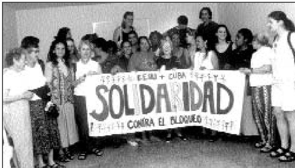
WILPF members gather with Cuban women at the community center in La Güinera, outside of Havana, during the WILPF/Hermanas Conference on Women’s Health and the Environment.