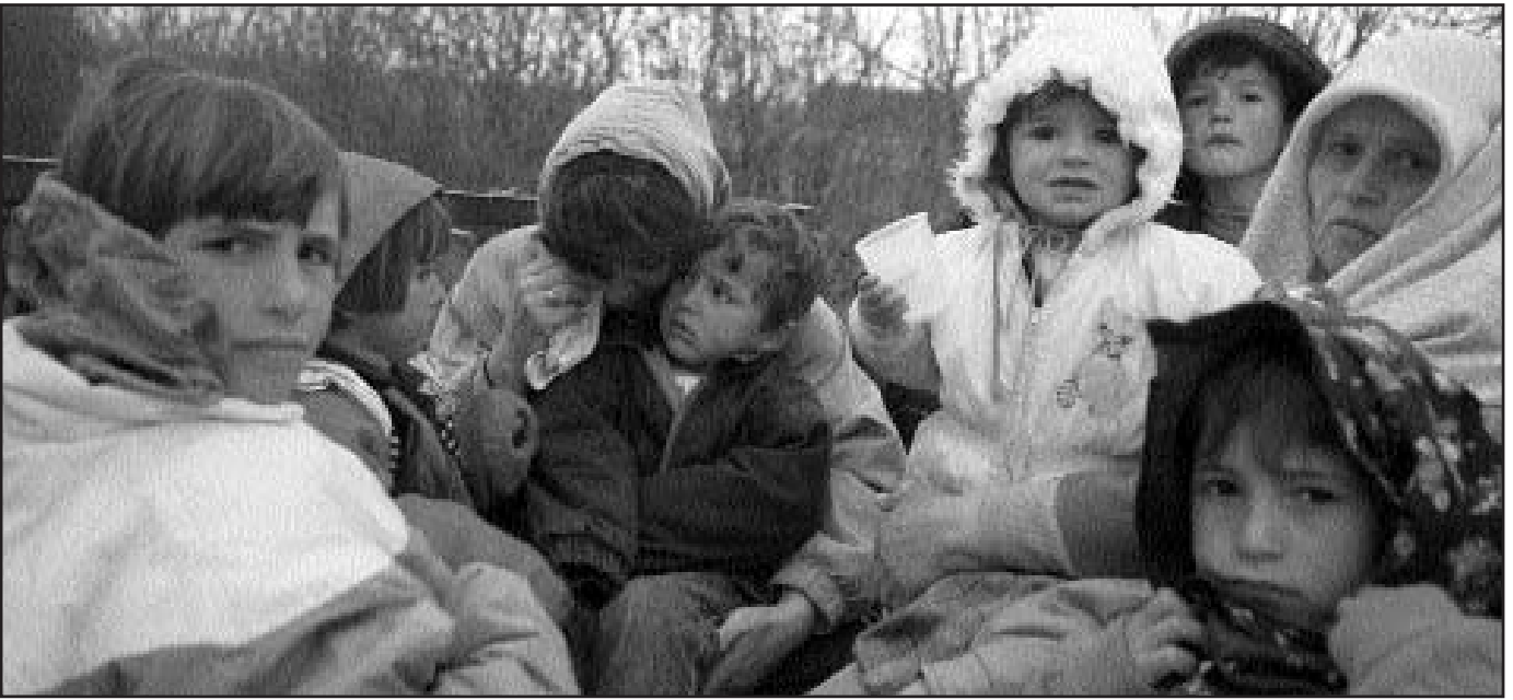
Kosovo, Yugoslavia: Albanian women and children flee Drvare in Kosovo during Yugoslav army shelling on March 3, at the same time as Albanian negotiators in Rambouillet agreed to sign the NATO peace plan.